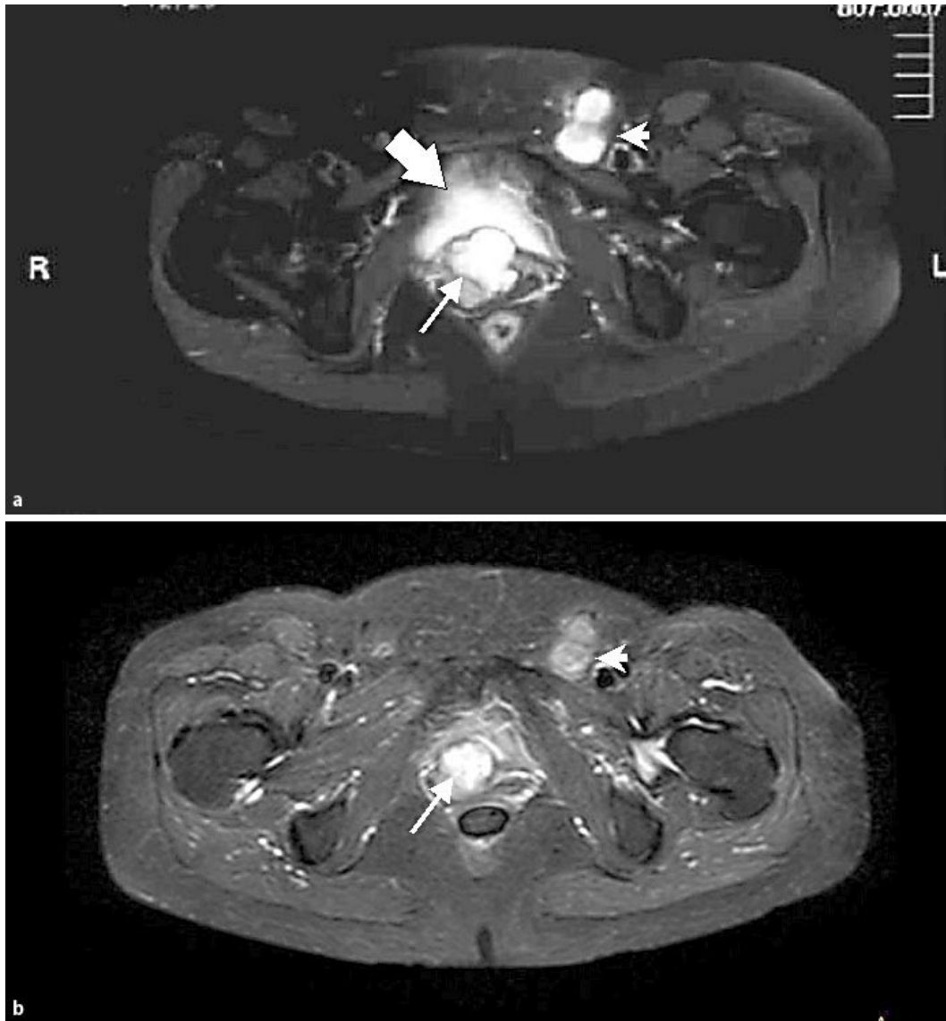
Fig. 1. Axial T2-weighted pelvic magnetic resonance images. a Two weeks prior to treatment, the 6.0-cm vaginal mass (arrow) and the left inguinal lymph node bed (arrowhead) are prominent. Note the close proximity of the primary tumor to the bladder (block arrow). b Imaging of similar section shows partial response to therapy after external beam radiation treatment and before brachytherapy treatment. The tumor appears to have central necrosis.